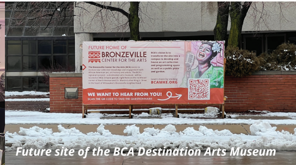
Future site of the BCA Destination Arts Museum