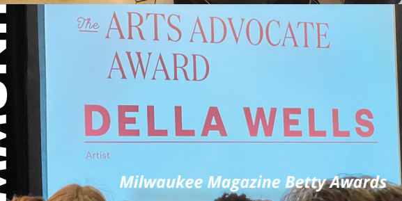
Milwaukee Magazine Betty Awards