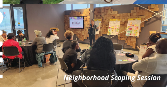
Neighborhood Scoping Session