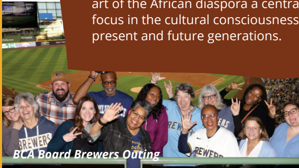
BCA Board Brewers Outing

The BCA seeks to elevate the human capacity for creativity and knowledge, expand Bronzeville's legacy as a vibrant artistic hub of the Midwest, and make art of the African diaspora a central focus in the cultural consciousness of present and future generations.