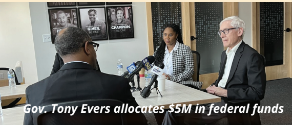
Gov. Tony Evers allocates $5M in federal funds

"We are grateful to Governor Evers for his continued support of the Bronzeville Center for the Arts and our vision for a destination arts museum that increases our collective knowledge of and engagement with African American art, art history and artists. As we continue the design process and evaluate community feedback, this announcement is a major step toward making our vision a reality. We also continue work on our Gallery 507 project, the BCA's first development in Bronzeville. We look forward to a 2024 opening."