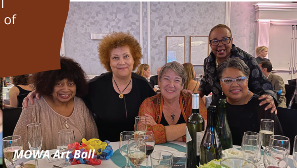
MOWA Art Ball