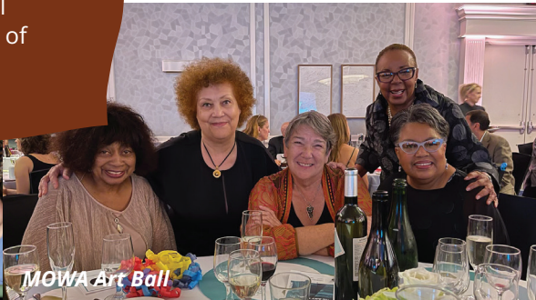
MOWA Art Ball