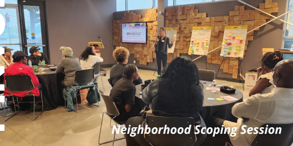
Neighborhood Scoping Session