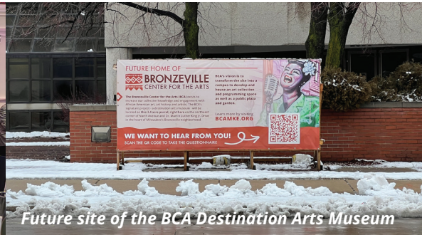
Future site of the BCA Destination Arts Museum