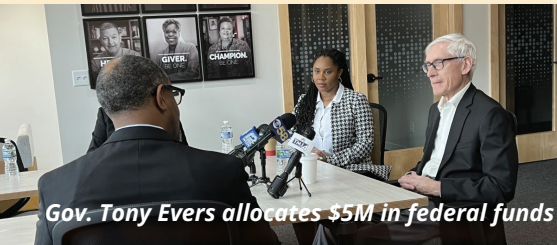
Gov. Tony Evers allocates $5M in federal funds

"We are grateful to Governor Evers for his continued support of the Bronzeville Center for the Arts and our vision for a destination arts museum that increases our collective knowledge of and engagement with African American art, art history and artists. As we continue the design process and evaluate community feedback, this announcement is a major step toward making our vision a reality. We also continue work on our Gallery 507 project, the BCA's first development in Bronzeville. We look forward to a 2024 opening."