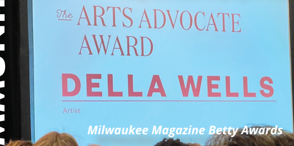
Milwaukee Magazine Betty Awards