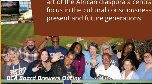
BCA Board Brewers Outing